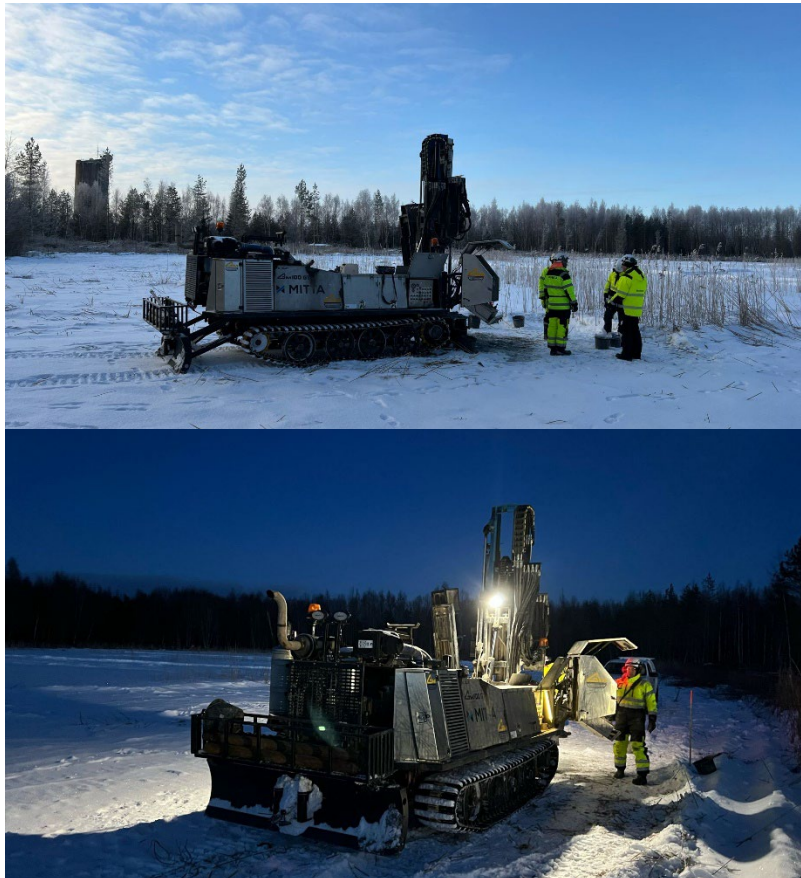
Figure 1: Korsnäs TSF drilling underway February 2024 – Drilling campaign should be completed by the end of the month and dispatch of samples ongoing.

Prospech Limited (ASX: PRS, Prospech or the Company ) is pleased to announce the commencement of drilling at the historical Korsnäs Tailings Storage Facility ( TSF ) within the Company's Korsnäs rare earth element ( REE ) project in Finland.