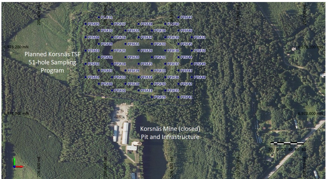
Figure 2: Korsnäs TSF north of the old lead mine which closed in 1972.

Prospech intends to conduct an approximately 50-hole drilling program to assess the REE content of the historic TSF at Korsnäs (Figure 4). Previous TSF sampling, limited to four near-surface grab samples, averaged 4,139 ppm TREO 1 . The drilling program will involve holes to depths of 9 or 10 metres, producing an estimated 470 1-metre samples. Each sample will undergo assay, with results compiled to generate a mineral resource estimate for the TSF. Additional samples will be collected for future metallurgical test work.