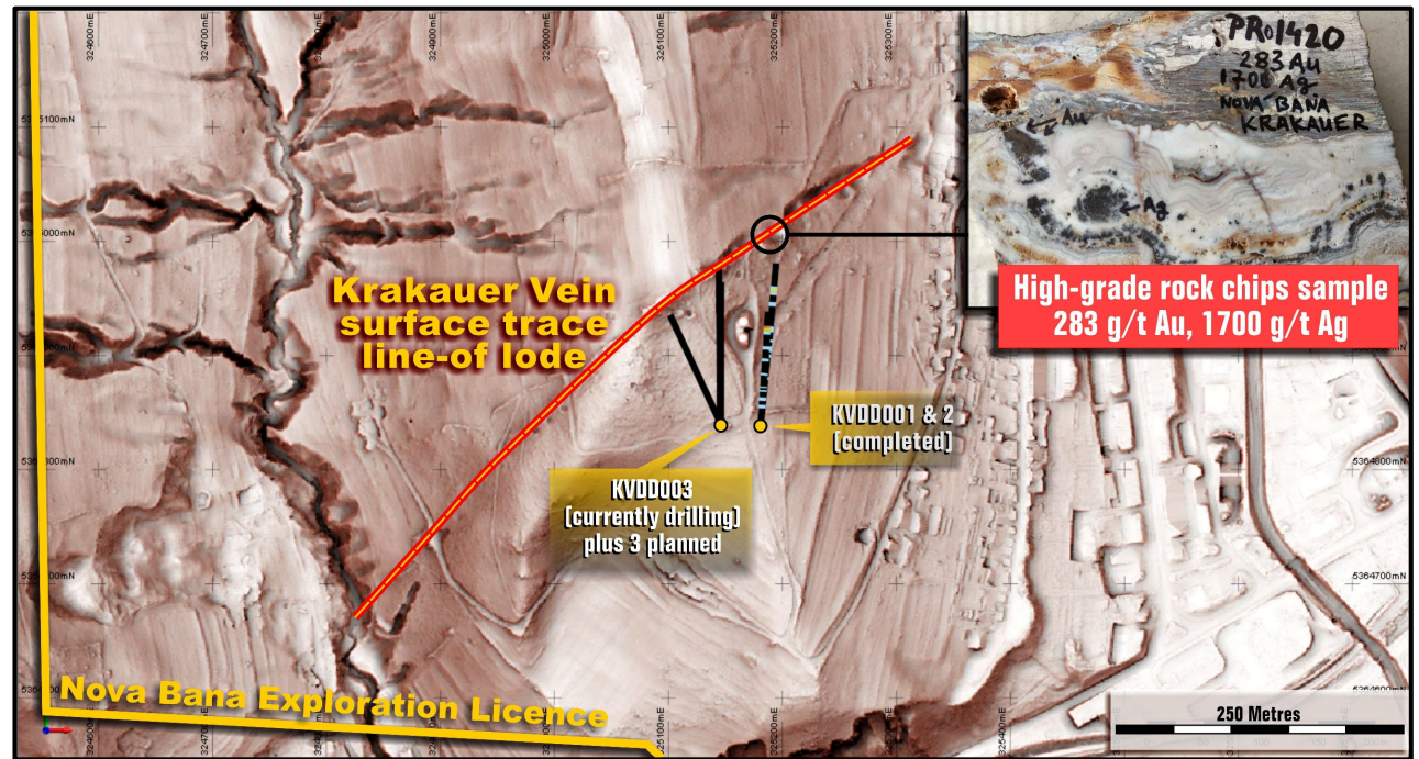
Map of the Krakauer structure showing the location of the 2 completed, 1 current and 3 planned diamond drill holes