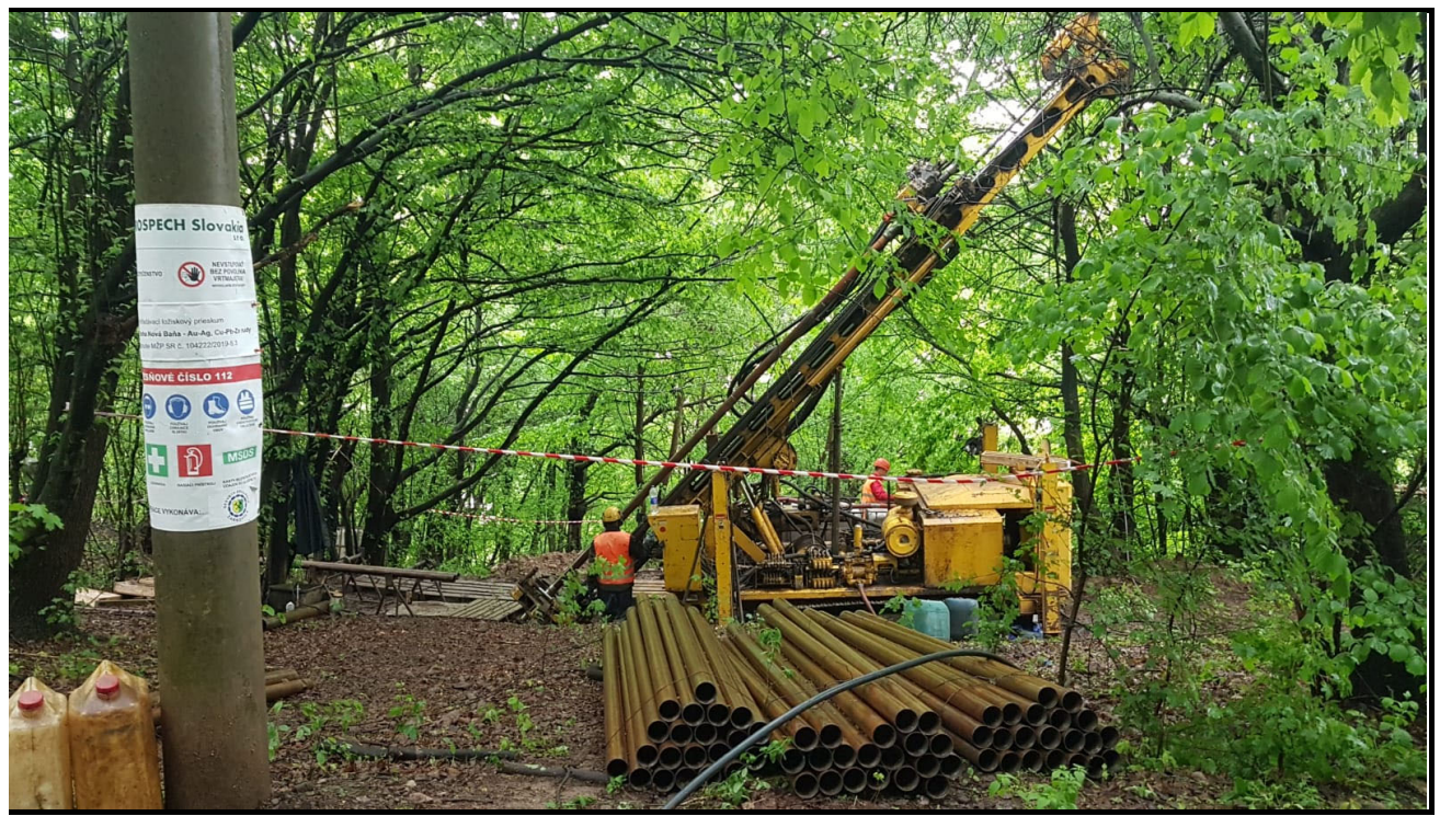
Krakauer structure being drilled with the third hole currently underway. Initial drill results have been reported on 23 July 2021.