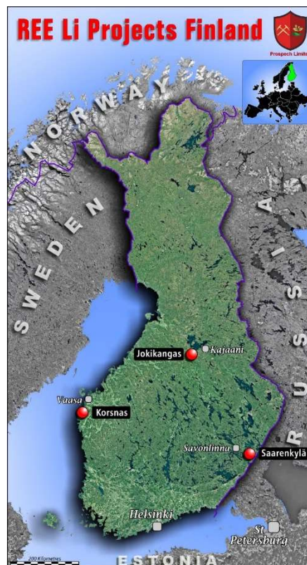
Location map of the Bambra projects in Finland

Finland is recognised as a favourable mining jurisdiction within the European Union and has been ranked ninth globally in the 2021 Fraser Institute Annual Survey of Mining Companies' Policy Perception Index and 13th in the Investment Attractiveness Index, surpassing jurisdictions such as Queensland, NSW, and Victoria.